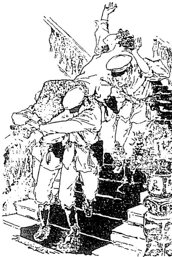
The four of them carried Feng-hsi downstairs by main force.

For one of the servants to sit down with the general—it would be ridiculous.” General Liu smiled and said, “What’s ridiculous about it? I choose to raise you up, and I’ll do as I please. Your mistress herself started off even lower than you.” Hsiu-ku said, “It really isn’t convenient, let’s talk about it another time.” With these words, she went downstairs. General Liu was very pleased with her modest demeanour; he slapped the railings with his hand and laughed heartily.