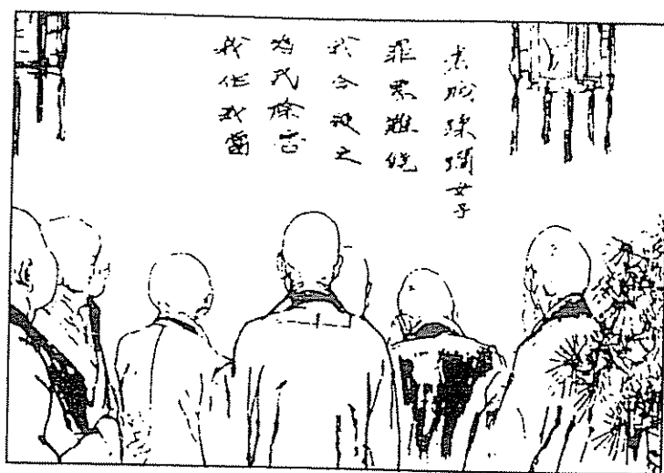
They saw blood spattered on the whitewashed wall, forming a scrawled message . . . .

our society and nation. Slashing his arm, I dipped cotton wadding in his blood and wrote on the wall, to make it clear that I and I alone am responsible for this act. The Republic of China, X year, X month, X day at midnight. (Signed) A Friend of Justice." The style was crude but clear, and the tone definitely that of a woman. The monks were much alarmed. They looked at the figure on the bed, and found it already stiff and lifeless. They immediately raced down the mountainside to inform the police, who telephoned the city and sent out search parties.